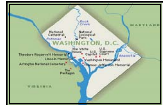
District of Columbia

net facility. The Magnet Recognition Program was developed to recognize healthcare organizations that provide the very best in nursing care.